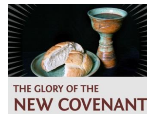
THE GLORY OF THE NEW COVENANT

God's Top Ten 1. Put God First 2. Worship Him Only 3. No Bad Words 4. Work 6 Rest 1 5. Obey Your Parents 6. Harm No One 7. Don't Cheat 8. If It's Not Yours, Don't Take It 9. Tell the Truth 10. Don't Be Jealous of Other People's Stuff