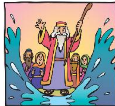
Moses and the Exodus