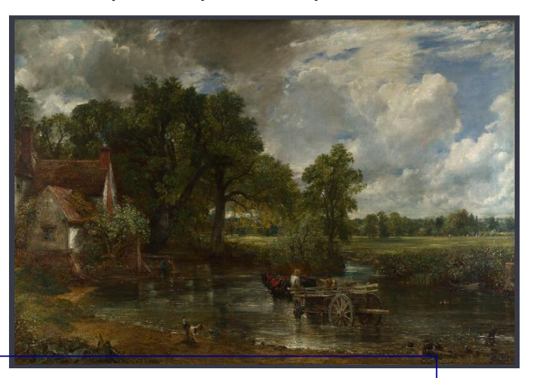
The Hay Wain painted by John Constable