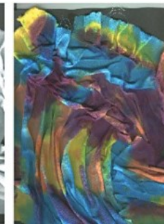
Fabric Relief Panels