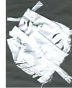
Construction / Deconstruction