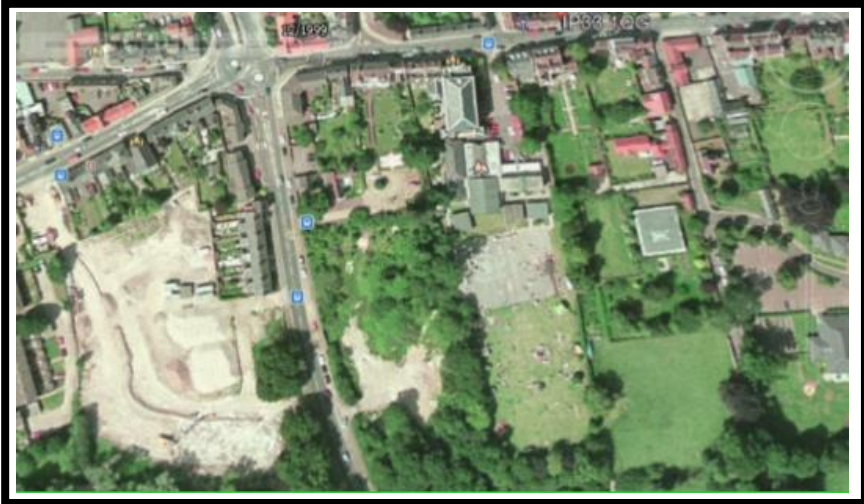
An aerial view of St Edmunds School in 1999.