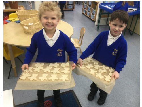
Salt dough tree decorations heading to the oven

There are a number of families who have signed up on Scopay to enable their child to bring home the travelling crib (Posada) for a night during Advent. We look forward to seeing the photos and drawings produced by the children capturing their reflections of the Christmas story and showing how the children have been interacting with the crib and sharing it with their family at home. Don't forget, if your child would like to bring home the Posada, please click on the consent tick box on Scopay under trips & events - Posada. To allow as many families to take part as possible, please only click to consent for one child in a family to bring home a Posada as this can be shared by the whole family.